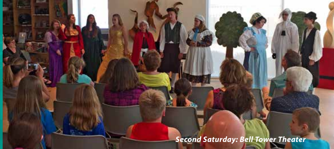
Second Saturday: Bell Tower Theater

The Dubuque Museum of Art is governed by a board of volunteer members.