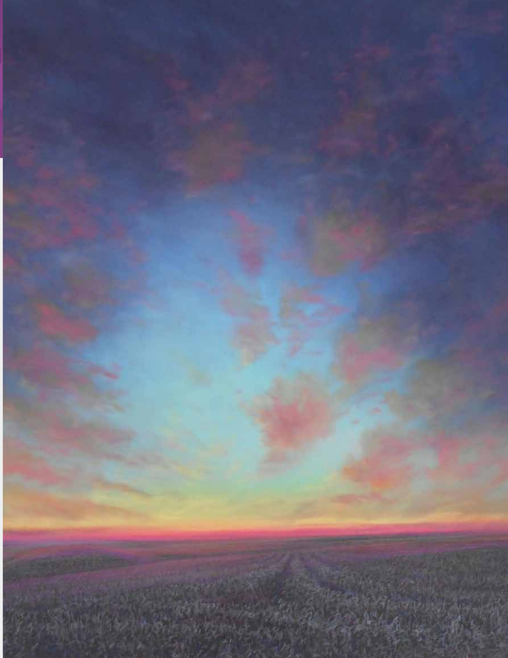
Image to the right: Ellen Wagener, Waiting for the Pink Floyd Moment (#4), 2015, pastel on paper, 15x15 in., collection of the artist